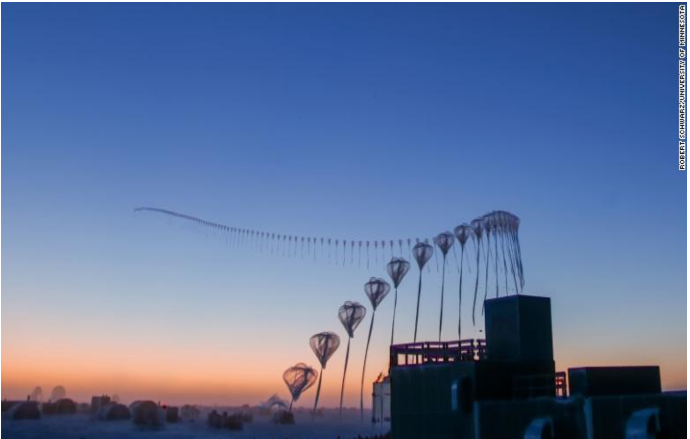
Picture Caption: A timelapse of weather balloons used to measure ozone.