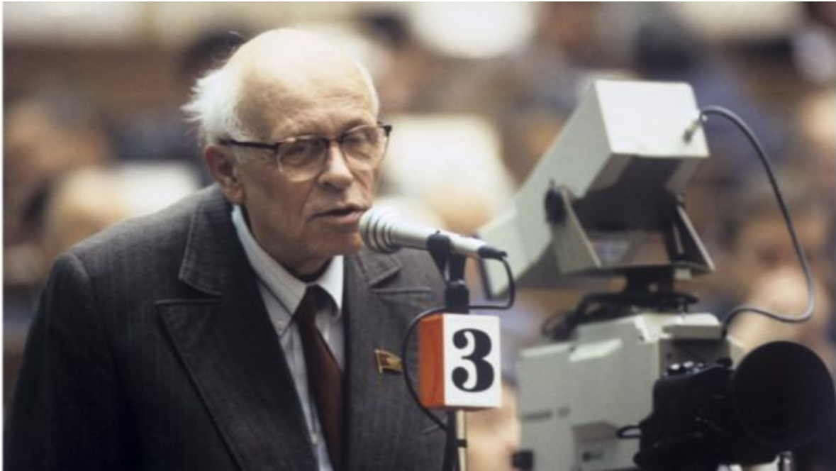
Andrei Sakharov developed nuclear weapons for the Soviet Union but later campaigned for disarmament. He proposed three conditions for producing matter and antimatter at different rates.

"The violation of CP symmetry is one of the (Sakharov) conditions for a matter-dominated Universe to exist, but the quark-driven effect is unfortunately much too small to explain why our Universe is mainly filled with matter.