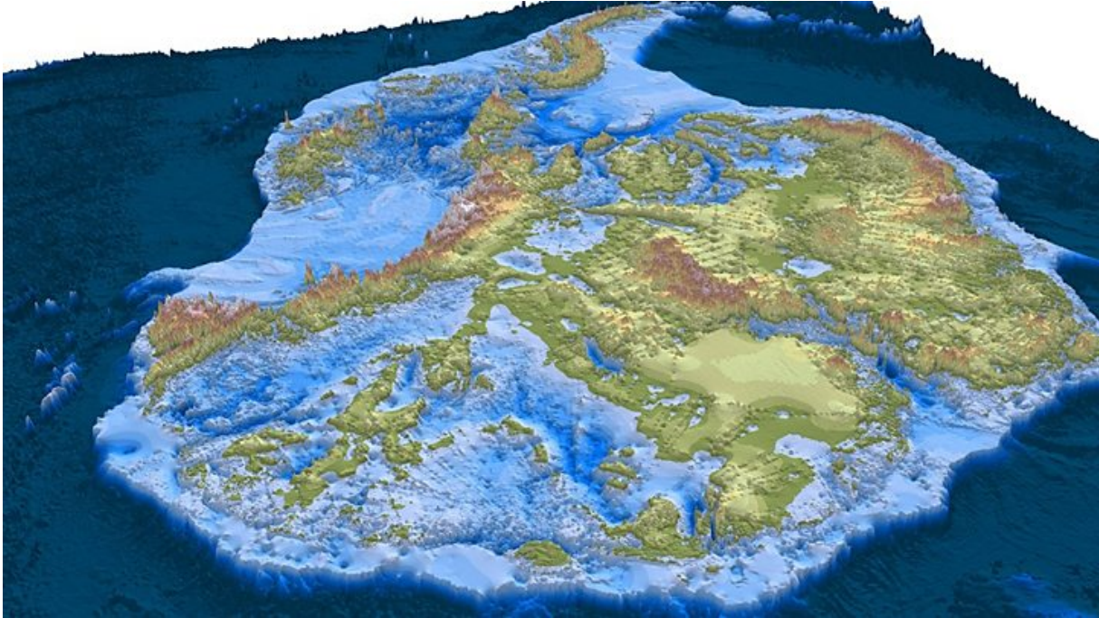
Mathieu Morlighem: "The shape of the underlying bedrock influences how glaciers flow"

and roughness of the hidden valley floor.