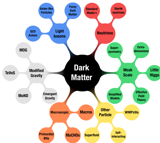
The possible explanations for the nature of dark matter. (Image: G. Bertone and T. M. P. Tait)

“10 years ago, experiments (at the LHC and beyond) were searching for dark-matter particles with masses above the proton mass (1 GeV) and below a few TeV. That is, they were targeting classical WIMPs such as those predicted by SUSY. Fast forward 10 years and dark-matter experiments are now searching for WIMP-like particles with masses as low as around 1 MeV and as high as 100 TeV,” says Tait. “And the null results from searches, such as at the LHC, have inspired many other possible explanations for the nature of dark matter, from fuzzy dark matter made of particles with masses as low as 10^{-22} eV to primordial black holes with masses equivalent to several suns. In light of this, the dark-matter community has begun to cast a wider net to explore a larger landscape of possibilities.”